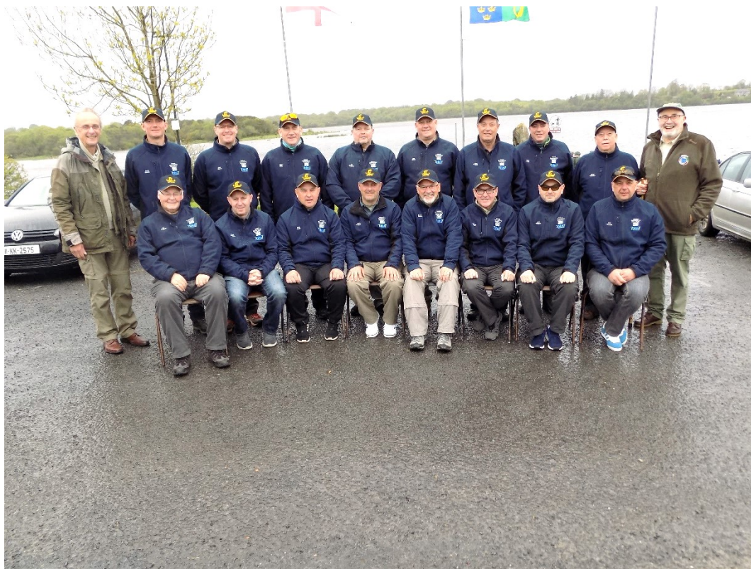
2018 Spring Team at Lough Mask